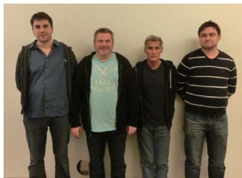
Swiss Place Winners: Poland